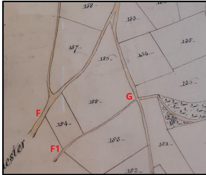
Section of the map with red letters F, F1 and G added to mark the application route.