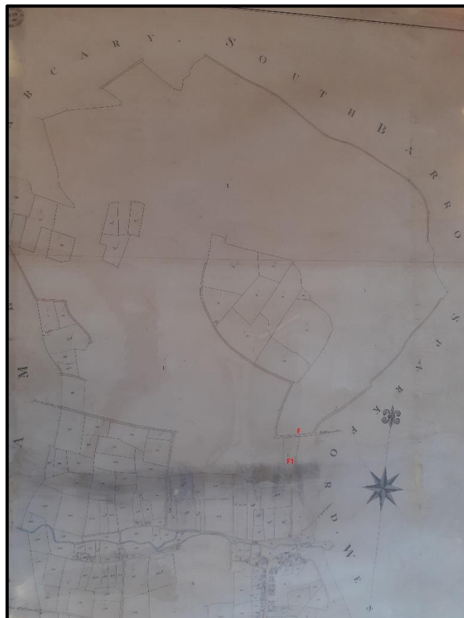
The tithe map with red letters added to mark the application route